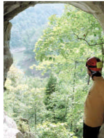
View of Buck Creek from High on the Cliff Cave, Pulaski County, Kentucky.

The Kentucky Speleological Survey will take the work of many in order for it to be a success. I am honored that I have been chosen as Interim President, and I hope that we can continue together to reach this goal and found an organization that we will all be proud of.